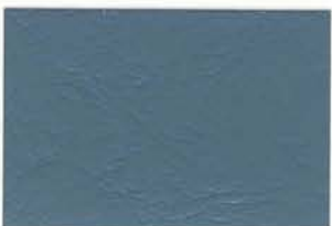
Wedgewood Blue 18C37