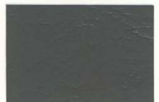
Merlin Grey 18B25