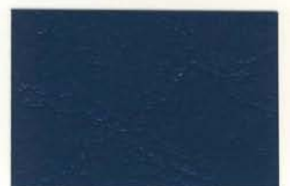
Pacific Blue 18E58