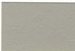
Goosewing Grey 10A05