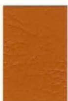
Golden Glow 06E56