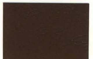
Vandyke Brown 08B29