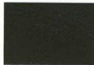
Juniper Green 12B29