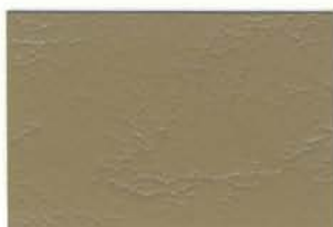
New Grey 10B23