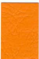
Tangerine Orange 06E53