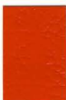
Poppy Red 04E53