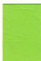
Linden Green 12E53