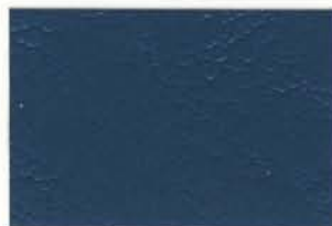
Ocean Blue 18C39