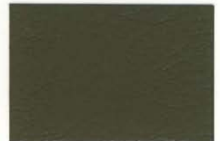
Olive Green 12B27