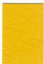
Golden Yellow 08E51