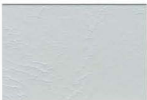
Pigeon Grey 18B17