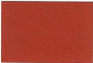
New Red 04D44