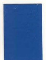
Cornflower Blue 18E53